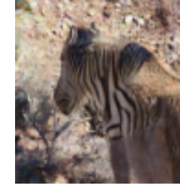
P_{0.5}(w, f) \rightarrow Q_{12}(w, f)