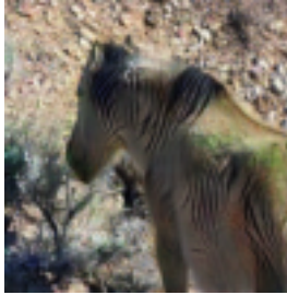
P_{0.5}(w) \rightarrow Q_{12}(w, f)